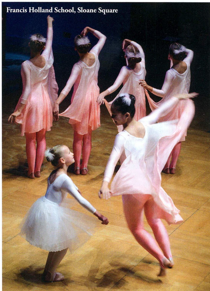
Francis Holland School, Sloane Square