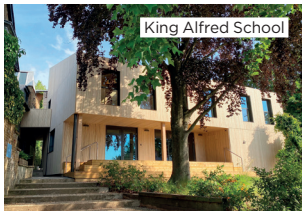
King Alfred School

The Duke of Westminster opened Francis Holland School's new Sixth Form Centre which offers the opportunity for the 150 sixth form girls to collaborate with entrepreneurs in the community and network with those committed to changing the mindset of the next generation.