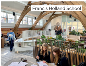
Francis Holland School