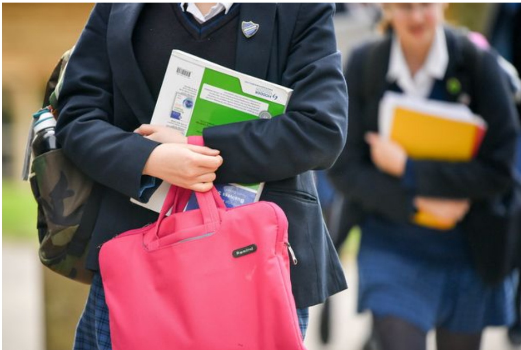
School pupils holding bags and books

Boarding schools in the UK have been advised to let students return home as the number of coronavirus cases continues to rise – despite official guidance for schools to remain open as usual. The Boarding Schools' Association (BSA) warned its members – which include Eton College, Gordonstoun School and Cheltenham Ladies College – that schools could remain responsible for pupils for a “protracted period of time” if the government decided to close schools and boarders were then unable to get home.