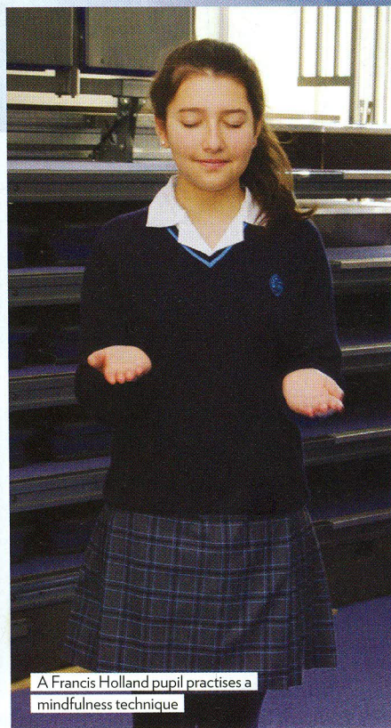
A Francis Holland pupil practises a mindfulness technique

Bedales Brighton and Hove High School Felsted Prep Notting Hill and Ealing High School St Mary's, Calne