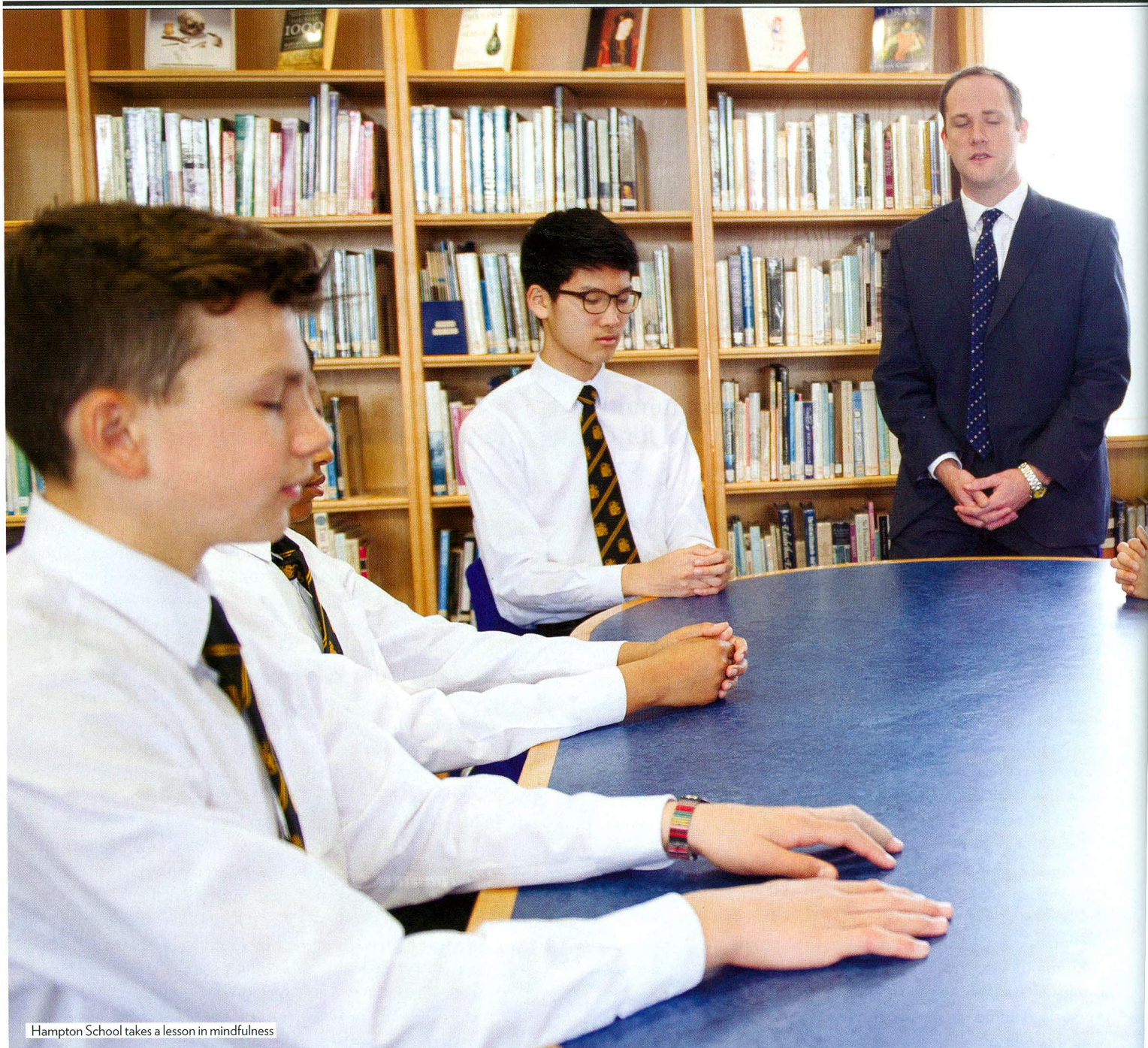
Hampton School takes a lesson in mindfulness

engage adolescents in the classroom context. Schoolchildren are, in effect, conscripts, so when a group of 30 adolescents tumbles into your classroom on a wet Tuesday morning how do you engage them in something requiring them to sit still in silence for long periods?