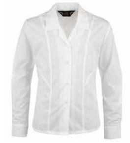
Long Sleeve White Blouse