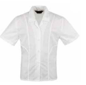
Short Sleeve White Blouse