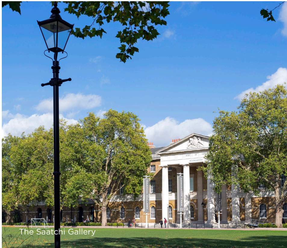
The Saatchi Gallery