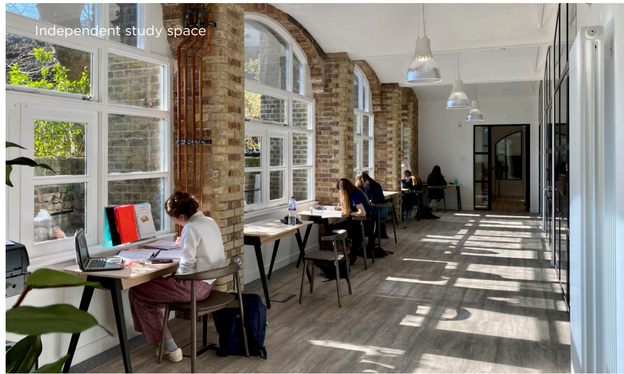
Independent study space