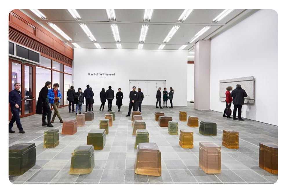
'One Hundred Spaces' - 1995

She was appointed Commander of the Order of the British Empire (CBE) 2006 and Dame Commander of the Order of the British Empire (DBE) in the 2019 Birthday Honours for services to art.