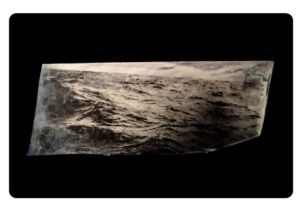
'Ice Shard' 2005

Realising the scale of the climate challenge he set about corralling fellow artists to articulate through a cultural narrative the need to have more than a single voice addressing such a global societal challenge. Working with twenty other artists led to The Cape Farewell exhibition at the Natural History Museum.