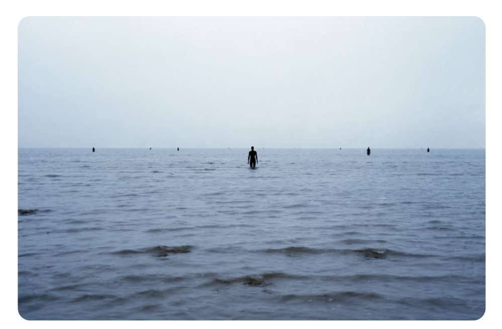
'Another Place' - 1997