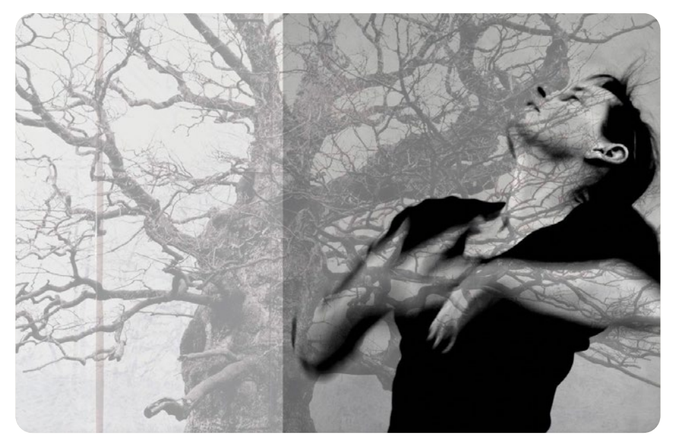
'Transparent' 2022: Unravelling the processes that underpin a life's work in dance.

In 2006, she opened the lottery funded and RIBA award winning Siobhan Davies Studios, a dance hub for classes, rehearsals and artistic support. Davies joined Cape Farewell's 2005 Art Science expedition, battling temperatures of -30°C just north of the 79th parallel.