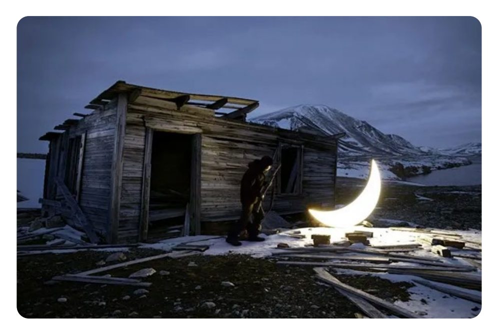
'Private Moon' 2010