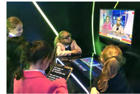
Year 4 Trip to Sky Studios