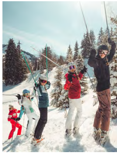
Ski Trip to Morzine