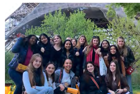
Year 12 French and Physics Trip to Paris