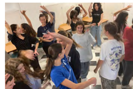
GCSE Spanish Trip to Seville