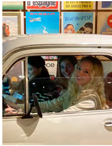
A Level Politics Trip to Brussels