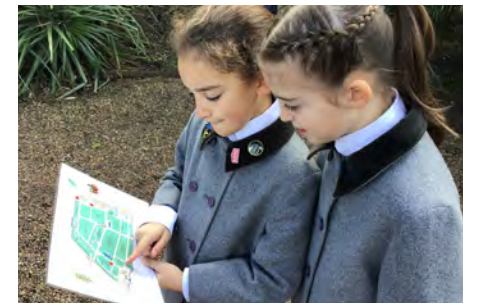
Year 4 Trip to Chelsea Physic Garden