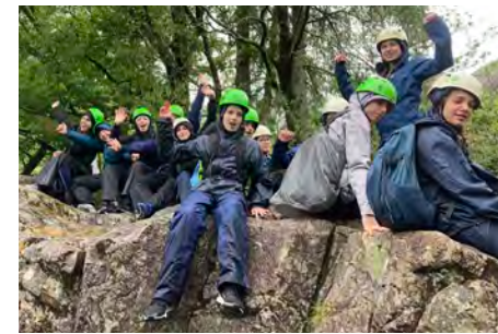
Year 9 Expedition Week

We take full advantage of our central London location by making frequent trips to art galleries and museums. Other trips which take the girls further afield, include: Choir Tours to European cities such as Venice and Athens; art and language enhancement trips to Florence and Paris; Sports Tours to South Africa and Barcelona; a geography tour to Iceland; a maths trip to China and a school exchange to New York to name but a few.