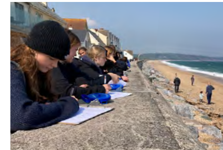
Year 10 Trip to Slapton Ley