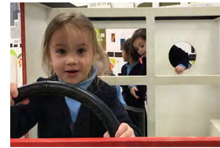
Reception Trip to the Postal Museum