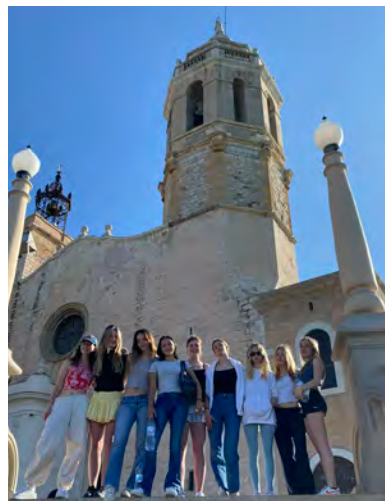
A Level Geography Trip to Barcelona