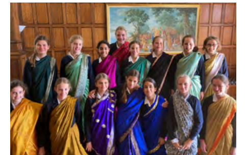
Year 8 Trip to Bhaktivedanta Manor