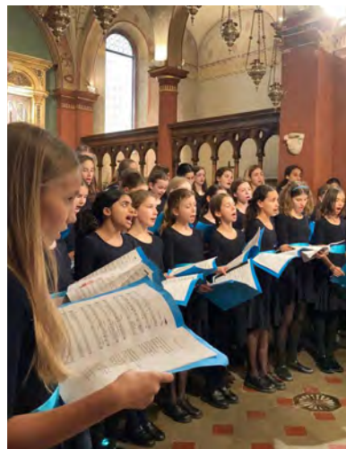
Lower School Choir Tour to Tuscany