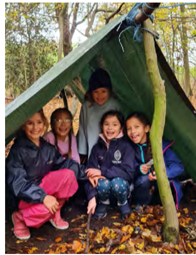
Year 3 Forest School Trip