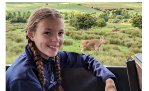
Year 7 Biology Trip to Port Lympne Safari Park