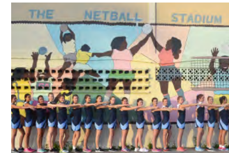
Sports Tour to Barbados