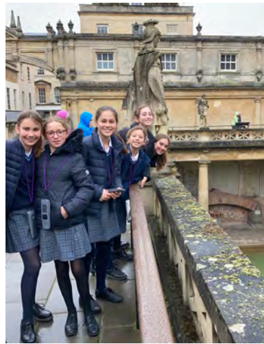
Year 7 Classics Trip to Bath