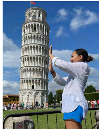
Year 12 Maths Trip to Florence