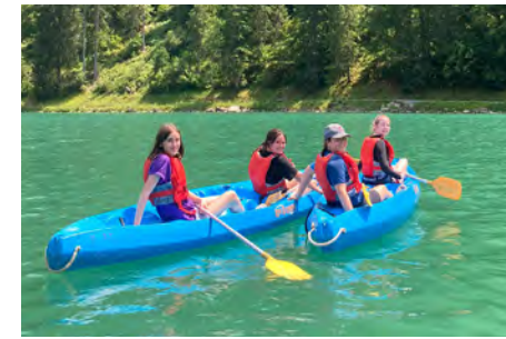
Year 10 Expedition to Morzine