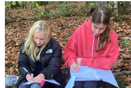
Creative Writing Trip to Devon