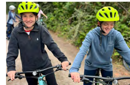
Year 8 Expedition Week