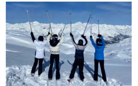
Ski Trip to Les Menuires