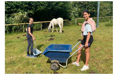
Year 6 Trip to Somerset