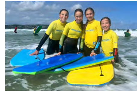
Year 7 Expedition Week