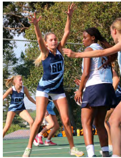
South Africa Netball Tour