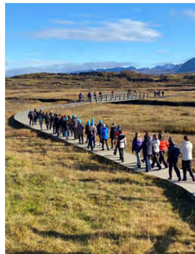
Year 10 Geography Trip to Iceland