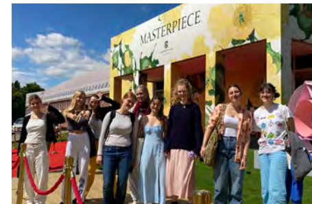
Year 12 History of Art Trip to Masterpiece Art Fair