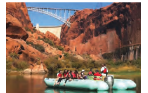
Year 10-13 Geography Tour to Colorado