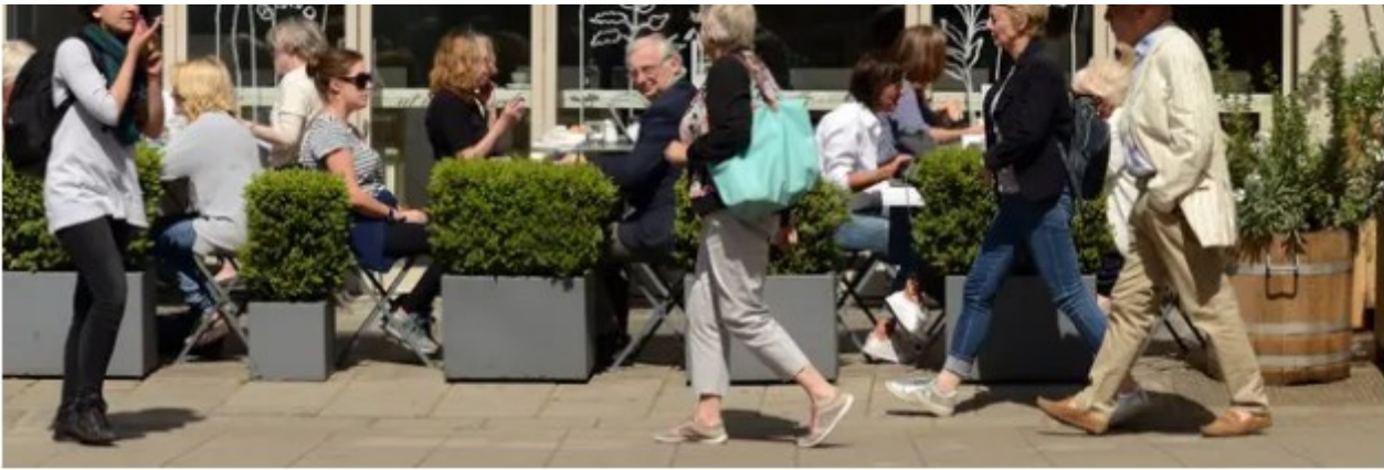
Hubs like Daylesford Organic and Natoora in Sloane Square make sustainability a great pleasure