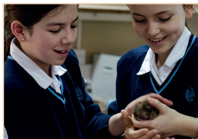
For whom: Year 7 Run by: A member of the Science department

Members of the club enjoy learning to look after the wide variety of animals that we keep in school. These range from hamsters, gerbils and chinchillas to fish, a leopard gecko, a corn snake and even a tarantula!