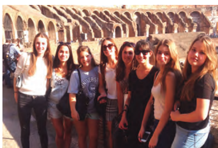
Sixth Form History of Art Trip to Rome