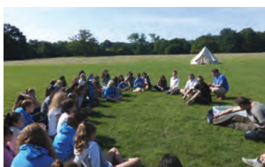
Year 9 Exploration Society Trip