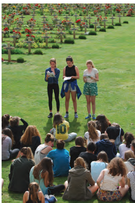
Year 10 History Trip to the Somme