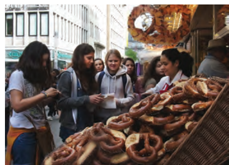
Year 9 German Trip to Cologne