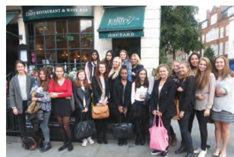
Sixth Form Psychology Trip