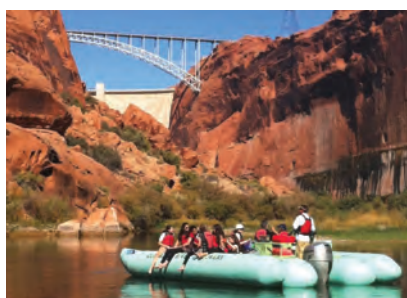
Year 10-13 Geography Tour to Colorado