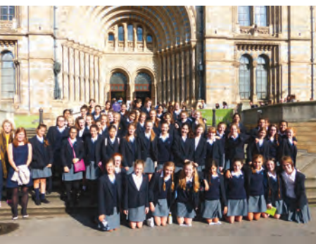
Year 9 Geography Trip to the Natural History Museum