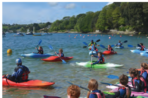
Year 6 in Cornwall