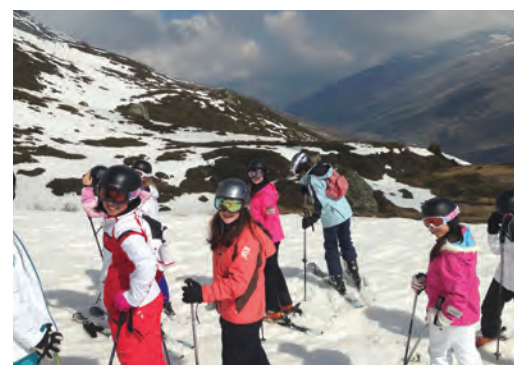
Ski Trip to Les Menuires, France