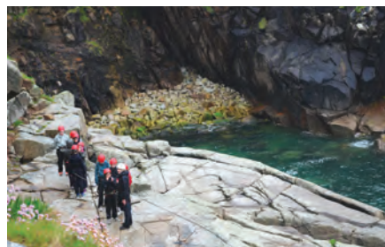
Year 6 in Cornwall