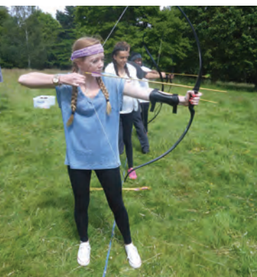
Sixth Form Induction Day