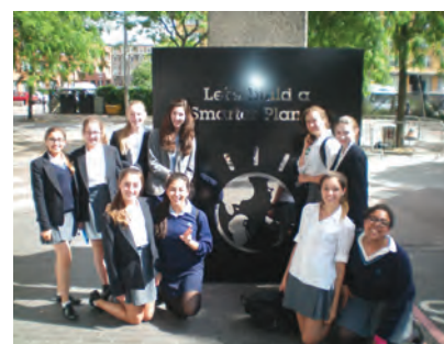
Year 10-11 Careers Trip to IBM