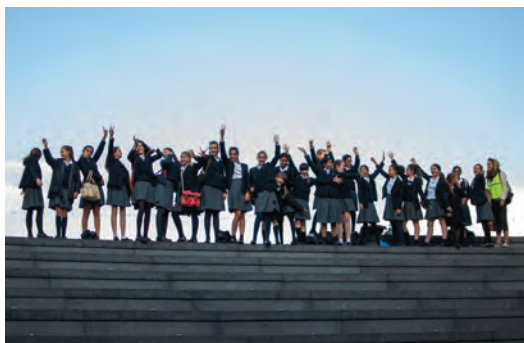
Year 8 Geography Field Trip to the City of London