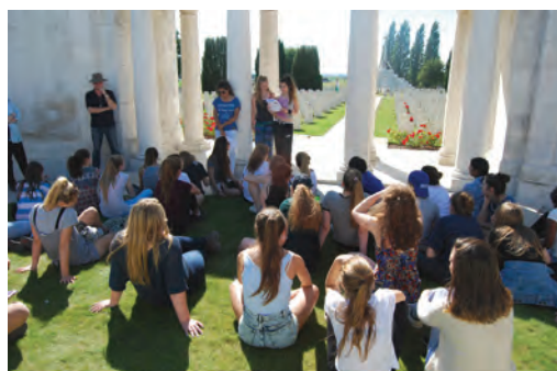
Year 10 Trip to the WWI Battlefields