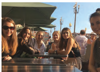
Sixth Form Art Trip to Nice