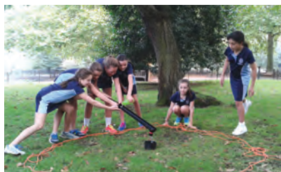
Year 7 Team Building in Battersea Park