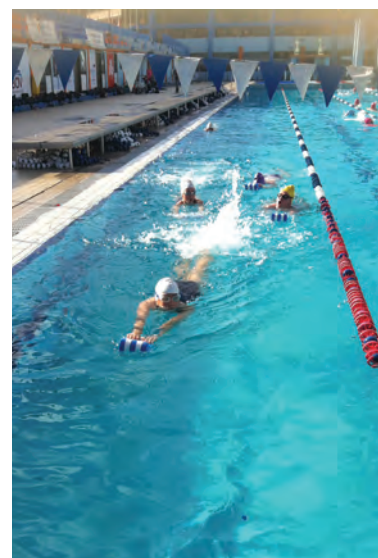
Year 9-10 Sports Tour to Malta