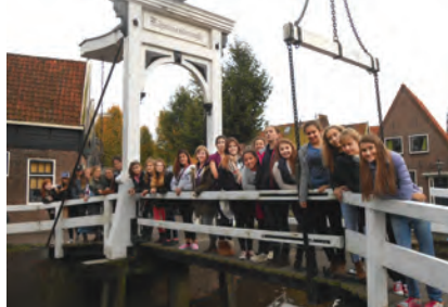
Middle School Choir Tour to Amsterdam