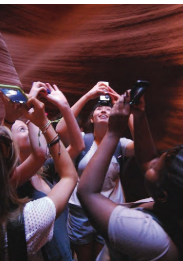
Year 10-13 Geography Tour to Colorado