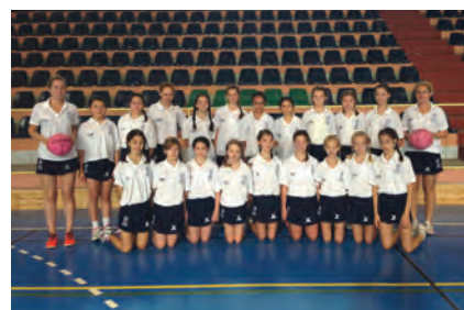
Year 9-10 Sports Tour to Malta