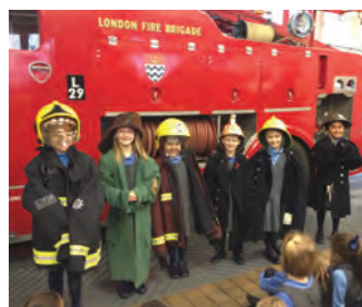
Year 2 Trip to the London Fire Brigade Museum