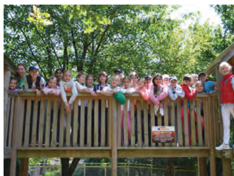
Year 5 at Port Lympne Wild Animal Park