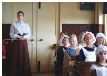
Year 2 Trip to the Ragged School Museum