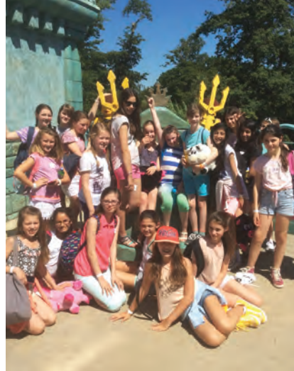
Year 7 Legoland Trip