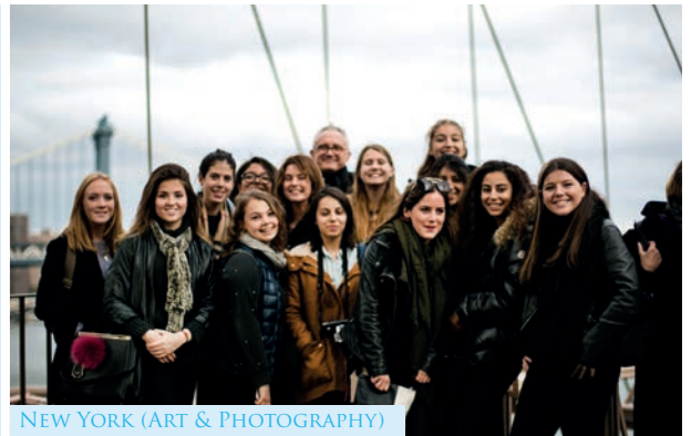
NEW YORK (ART & PHOTOGRAPHY)

As well as making the most of London, many departments organise visits to other parts of the country and abroad. Examples include Spanish trips to Barcelona and Valencia, Geography trips to Iceland and the US, Classics trips to Rome, Photography and Art trips to New York and History of Art trips to Venice, Florence, Paris and Madrid.