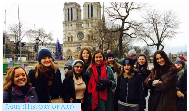
PARIS (HISTORY OF ART)