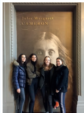
V&A AND SAATCHI GALLERY, LONDON